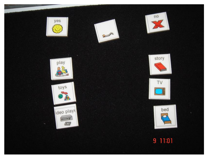
"What do you like to do in your Chailey?"